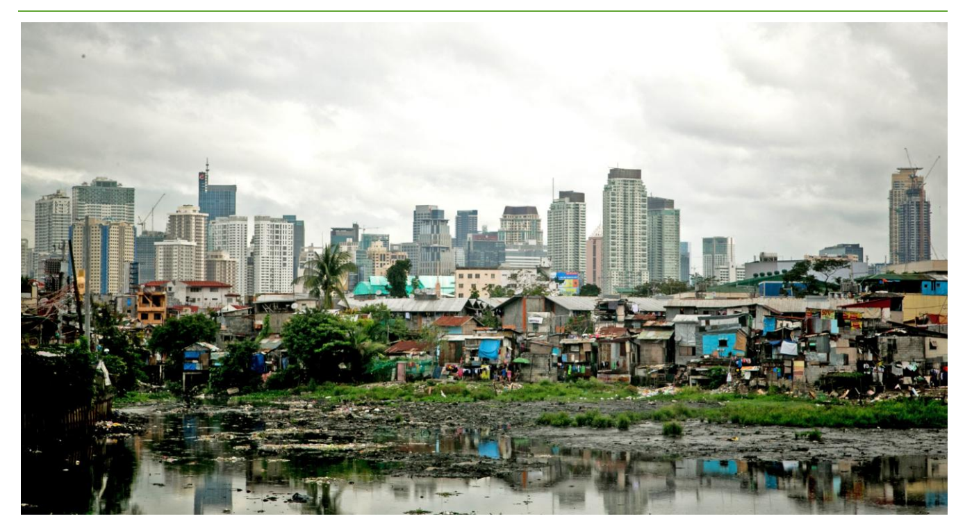
Tondo slum in Manila, Philippines (2014).