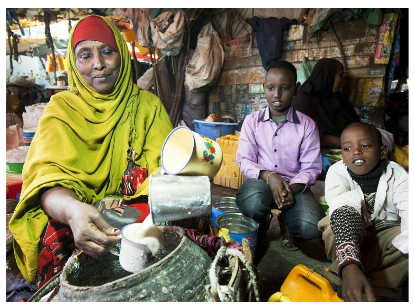
A woman trader in Hargeisa market serves a cup of fresh camel's milk. Small-scale business women often rely on remittances as start-up money for their stalls.