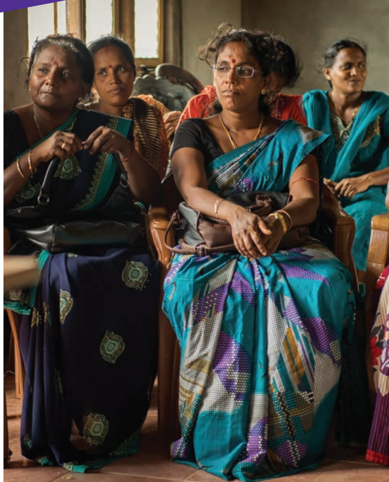
Mankulam, Sri Lanka: Women attend a meeting hosted by Oxfam's partner Yugashakthi, a women's federation group that promotes female empowerment and leadership, and aims to end violence against women and girls.

Using a market systems development approach, Oxfam is promoting women's economic empowerment in Sri Lanka by strengthening opportunities for women to earn an income from value chains, including spices, fruits and vegetables, and hand looms. We have improved the quality and production capacity of more than 200 micro, small and medium enterprises (MSMEs), resulting in a 20% increase in monthly revenue. Oxfam also supports MSMEs to create and supply new products to fashion and handicraft companies in Sri Lanka, including Barefoot and ODEL. Oxfam's Rapid Care Assessment has been used to recognise, redistribute and reduce the amount of unpaid care work performed by women.