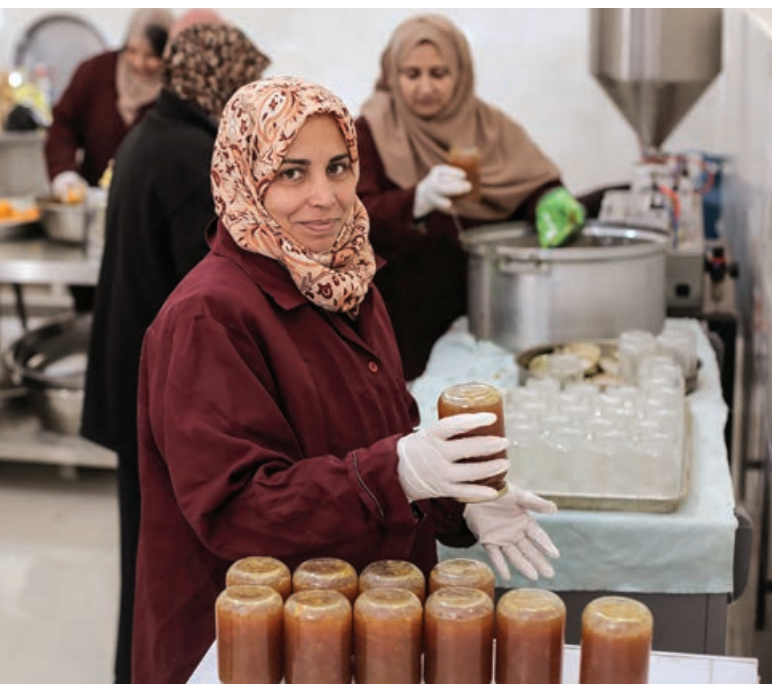
Northern Gaza, Occupied Palestinian Territory: Workers make marmalade at the Bent Alreef co-operative. The co-op is run by our partner Balah Palestine, an agro-business enterprise that gives women the chance to earn a living and take a lead in important decision-making processes. Funded by Australian Aid, this initiative has increased women's economic participation, improved their working environment and enhanced employee health.